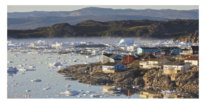
Figure 1: Greenland is losing ice five times as fast as it was 25 years ago

Some of the other impacts highlighted by scientists are irreversible.