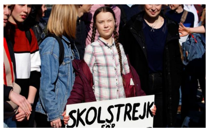
Figure 3: Image caption: Teenage campaigner Greta Thunberg has helped spark school strikes all over the world

"Do we incur a small but not insignificant cost now, or do we wait and see the need to adapt? The economics are really clear on this, the costs of action are dwarfed by the costs of inaction."