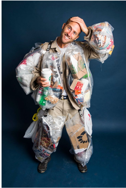
Figure 1: Greenfield is looking pretty trashy on day eight of 30.

Greenfield, who is a contributor to Outspeak – which has a publishing partnership with the Huffington Post – is hoping to make more people aware of the problem of everyday waste, and ideally get some to change their ways.